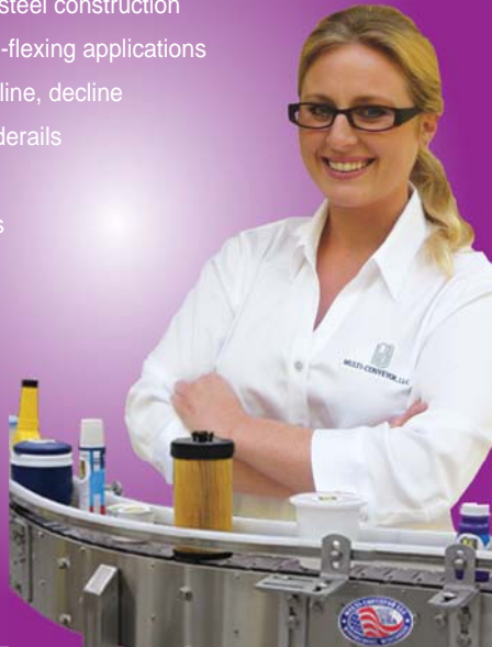
Table-Top Chain Conveyors Mat-Top Plastic Belt Conveyors